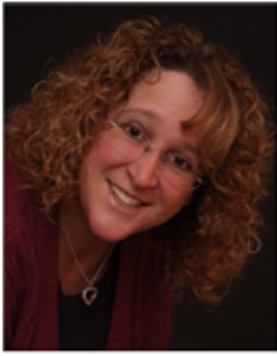
↑ Author Image

Penny Haynes ← Author Name (for font sizes LESS THAN 18) http://brainstormbusinesspodcast.com ← Author URL